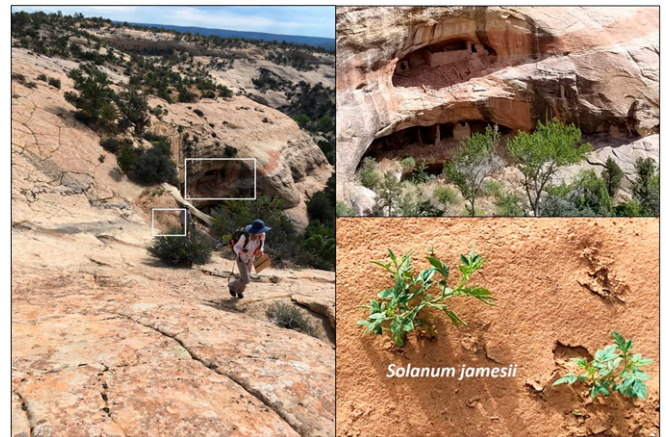
Fig. 3. Four Corners potato ( Solanum jamesii ) growing in sand at the base of slick rock waterfall, just above site 425A244, a two-story cliff dwelling in Bears Ears. The species reproduces only by tubers that have very limited dispersal capability. The situation repeats itself among archaeological sites in southern Utah, Arizona, and New Mexico.

In addition to the significant relationship between the number of architectural features and high ESR, the model predicts that sites with high ESR tend to be located in the central region of Bears Ears as well as on Cedar and Mancos mesas (Fig. 1 and SI Appendix , Fig. S8). Our model identifies specific locations within Bears Ears that will require special management regimes, especially in light of increased visitation and the proposed development or expansion of resource extraction activities in the recently downsized national monument. Those special regimes should be cross-cultural, developed with tribal input (44, 62, 63), to emphasize the conservation and restoration of archaeo-ecosystems that contain “high priority” plant species, especially those held sacred as lifeway medicines. It is likely that such rare or uncommon